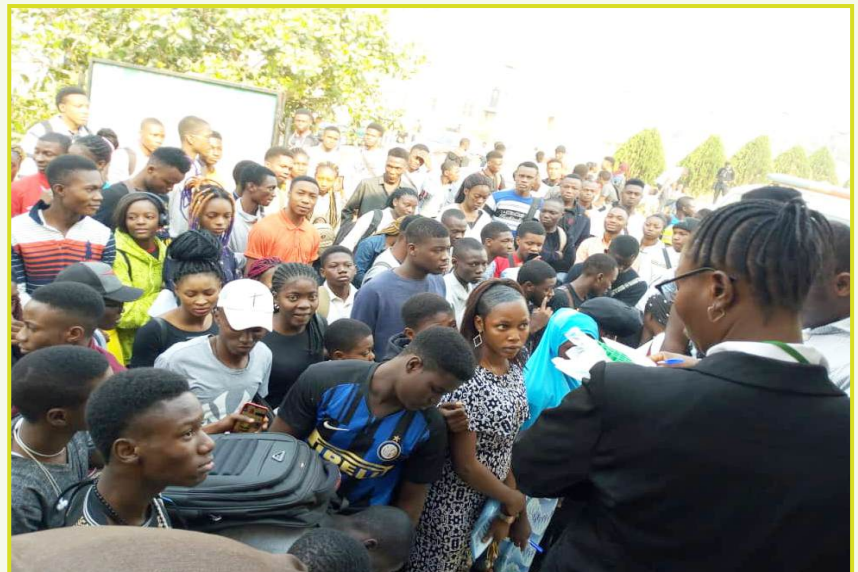
Vaccination in progress