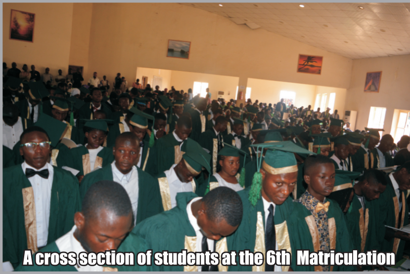
A cross section of students at the 6th Matriculation

Friday March 3, 2017 witnessed the 6 th Matriculation Ceremony of Federal University, Oye-Ekiti. The students, adorned in their flowing academic gowns, expectantly awaited the solemn and formal induction into their various fields of study.