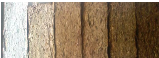
Figure 1. Comparative variation in colour of briquettes produced

Briquettes experienced larger percentage changes in the axial dimension than in lateral. Relative to the original dimensions the change in the axial direction reached up to about 9.78% compared to a maximum of about 4.56% in the lateral direction for briquettes produced with 100% waste paper. Other researchers reported a similar trend Mani et al. [12] during compaction of corn stover, Al- Widyan et al. [10] during briquetting of olive cake and Oladeji [13] during briquetting of two Species of Corn cob.